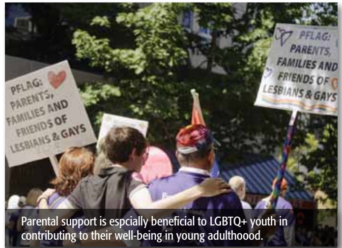
Parental support is especially beneficial to LGBTQ+ youth in contributing to their well-being in young adulthood.

The term LGBTQ+ is commonly used to describe individuals identifying as lesbian, gay, bisexual, transgender and queer or questioning — encompassing a diversity of sexual and gender expressions. 1 Sexual orientation is also commonly defined as one's sexual or romantic attractions, while gender identity is the sense of oneself as a girl or boy, irrespective of one's biological sex at birth. 1