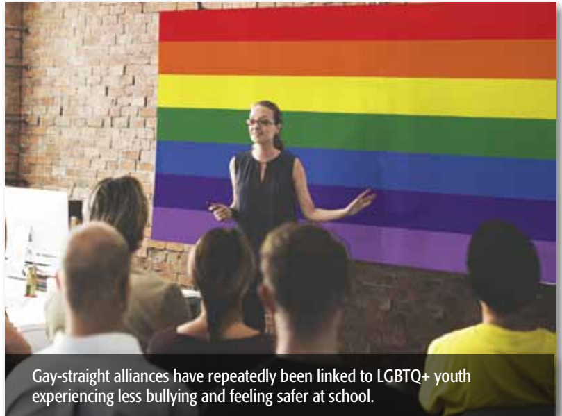
Gay-straight alliances have repeatedly been linked to LGBTQ+ youth experiencing less bullying and feeling safer at school.

To address this issue, we used a two-part approach. We first searched for systematic reviews on interventions for supporting LGBTQ+ youth in general. We then sought randomized controlled trials (RCTs) and observational studies in sexual-minority youth that examined mental health outcomes in particular. We built quality assessment into our inclusion criteria to ensure that we reported on the best available evidence. (For more information, please see our Methods .)