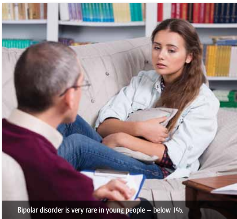
Bipolar disorder is very rare in young people – below 1%.

Significant controversies about bipolar disorder in children began in the 1990s, when dramatic increases in diagnoses fuelled questions and debates. 3-4 Since then, however, the controversy has waned. This waning has been due, in part, to research illuminating the likely cause for the diagnostic increases. Specifically, a review of diagnostic rates between 1985 and 2007 found that presumed prevalence increases did not indicate a