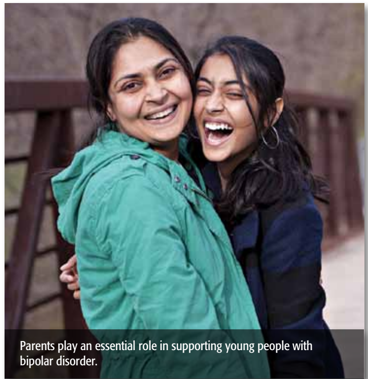
Parents play an essential role in supporting young people with bipolar disorder.

The RCTs varied in their dosing approaches. For aripiprazole and asenapine, dosing was fixed. 6-7 For lithium, quetiapine and risperidone, dosing was flexible, varying with therapeutic response. 8-11 As well, aripiprazole and risperidone were tested at two