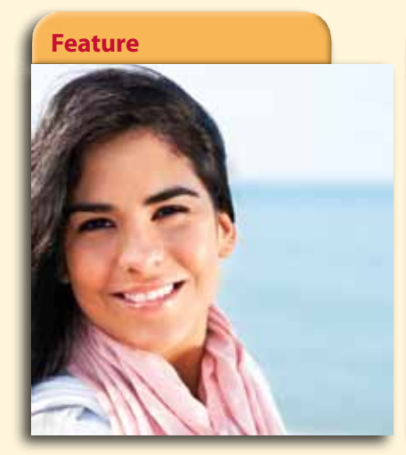
Native youth suicide: Behind the statistics