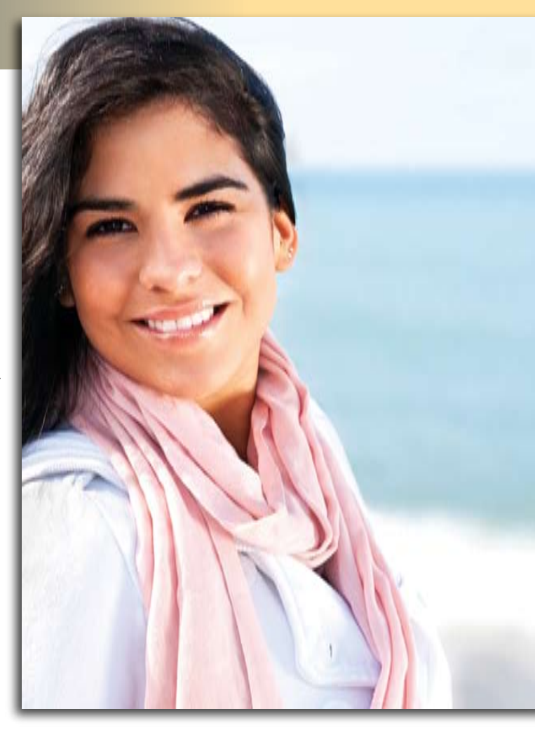
Cultural continuity is one of the strongest factors reducing the risk of suicide in aboriginal youth.

Eight cultural-continuity variables are detailed in Table 4. Each variable was measured using federal and provincial public data sources along with information provided by local community agencies.<sup>50</sup> Every variable was deemed "present" or "absent" (or measured dichotomously), except for children in foster care, which was measured as a proportion (or as a continuous variable).