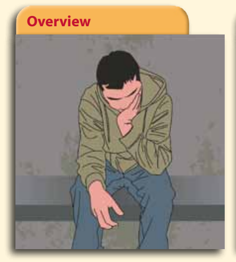
Even one is one too many