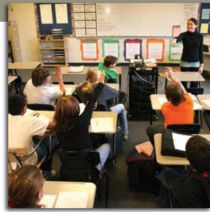
50S participants were 37% less likely to report a suicide attempt in the past three months than youth in the control group.

Two articles described an evaluation of a universal prevention program called Signs of Suicide ( SOS ).<sup>43, 44</sup> This program was aimed at American high-school students. Additional information on interventions and participants is provided in Table 2.