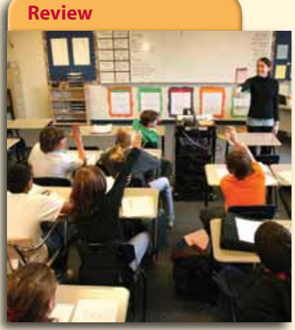
Reducing youth suicide: What works?