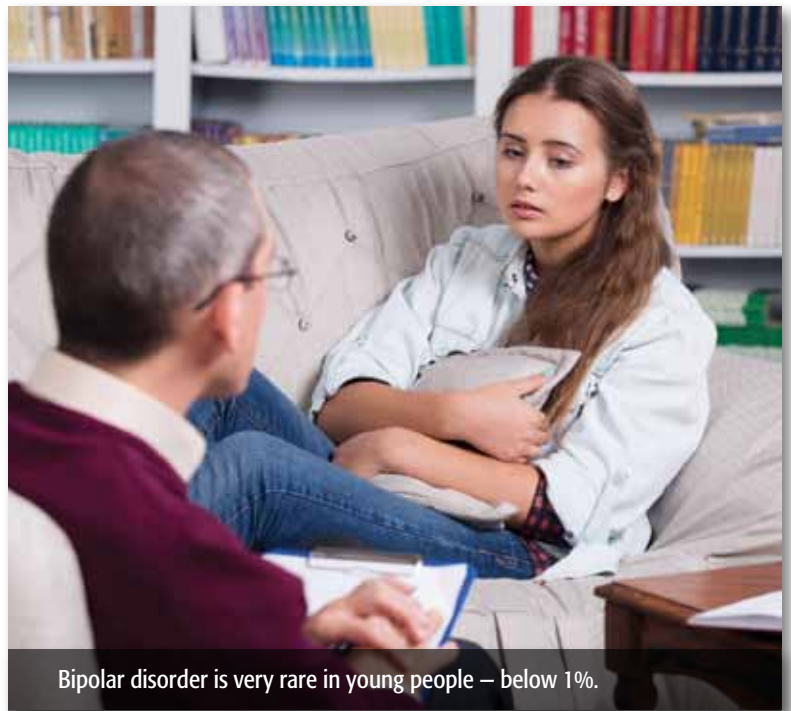
Bipolar disorder is very rare in young people – below 1%.

Significant controversies about bipolar disorder in children began in the 1990s, when dramatic increases in diagnoses fuelled questions and debates. 3-4 Since then, however, the controversy has waned. This waning has been due, in part, to research illuminating the likely cause for the diagnostic increases. Specifically, a review of diagnostic rates between 1985 and 2007 found that presumed prevalence increases did not indicate a