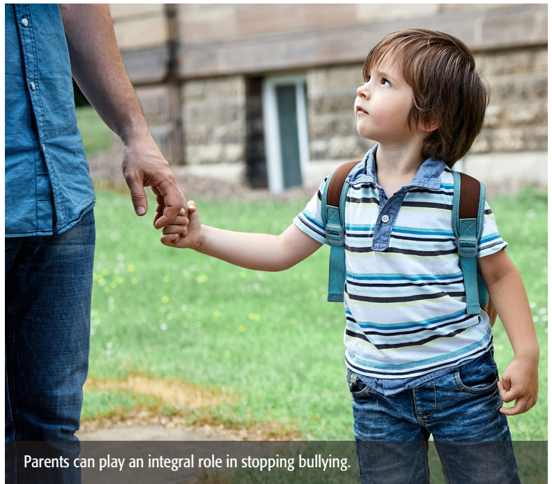
Parents can play an integral role in stopping bullying.

Bullying experiences have also been documented for youth closer to home. Among BC students aged 12 to 19 years, 53% reported experiencing at least one of three forms of bullying in the past year. 7 This included 39% having been socially excluded on purpose, 38% being teased to the point of feeling bad or extremely uncomfortable, and 8% being physically bullied. As well, 4% of students reported missing school due to bullying in the past month. 7 Many of the same bullying experiences were documented among Métis students