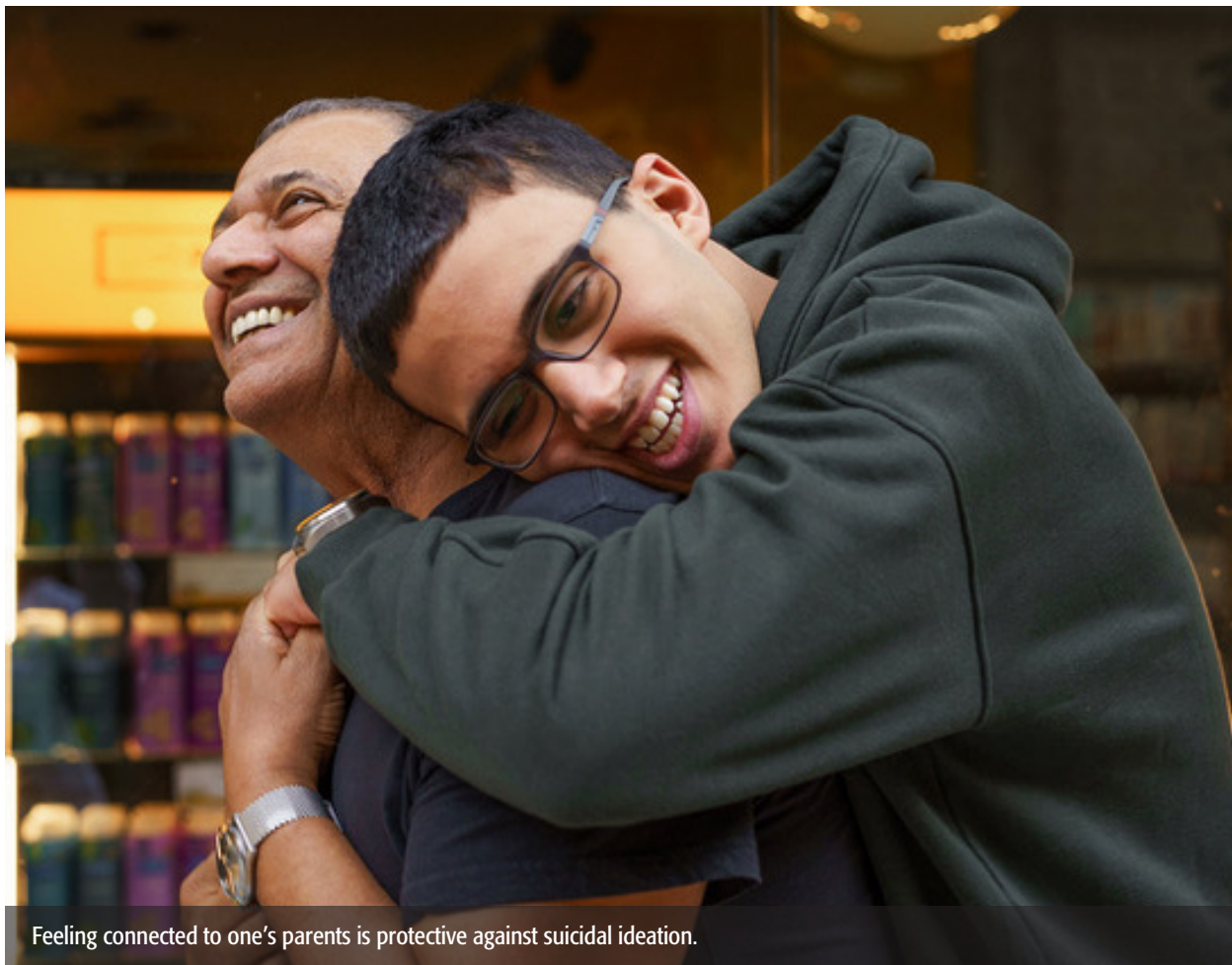
Feeling connected to one's parents is protective against suicidal ideation.

Suicide risk increased as the number of adversities increased — increasing 90% with two and increasing 160% with three or more.